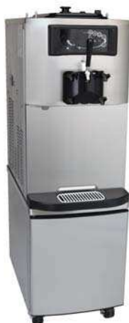
Optional Cart with front opening door

During long no-use periods, the standby feature maintains safe product temperatures in the mix hopper and freezing cylinder.