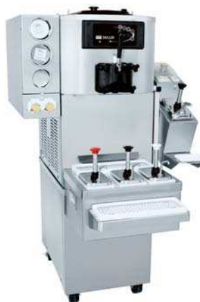
Optional Cart with rear door for front mount syrup rail