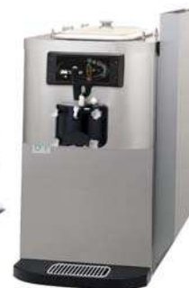
Optional Top Air Discharge Chute

Rockton, Illinois 61072 800-255-0626 Phone 815-624-8333 Fax 815-624-8000 www.taylor-company.com e-mail: info@taylor-company.com