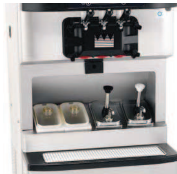
Integrated Syrup Rail Option - 2 room temperature with lids & ladles, 2 heated with syrup pumps

During long no-use periods, the standby feature maintains safe product temperatures in the mix hopper and freezing cylinder.