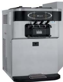
Shown with optional top air discharge chute.